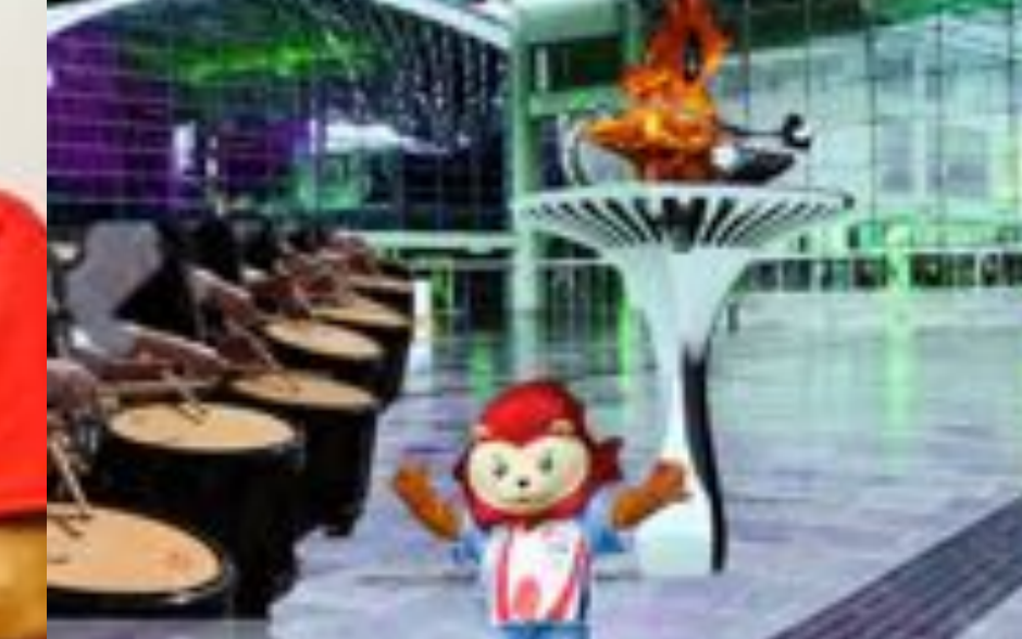
Celebration of Volunteers and Athletes

Extinguishing of Cauldron with Nila + 96 percussionists + 60 volunteers