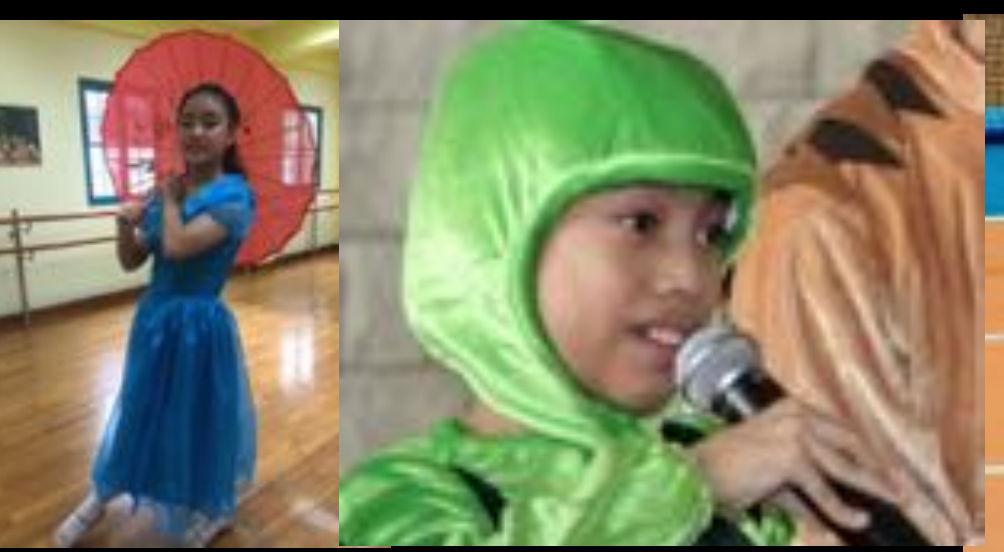
featuring Soloists of all abilities