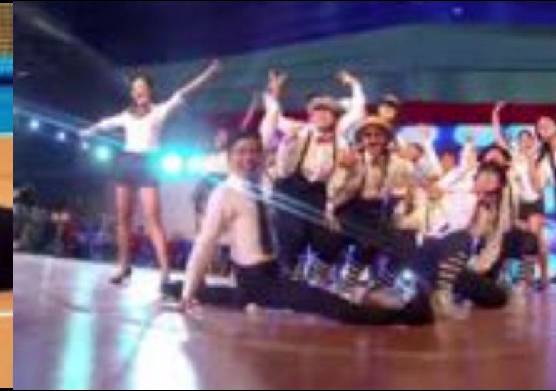
Anchored by athlete, performer and / or Creative Team member with disability