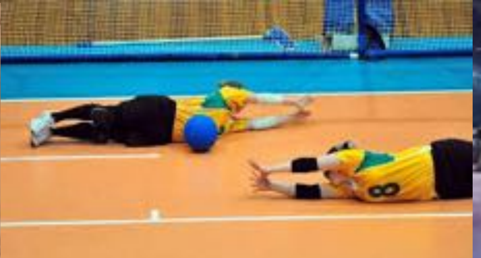
6500 people come together to play sports